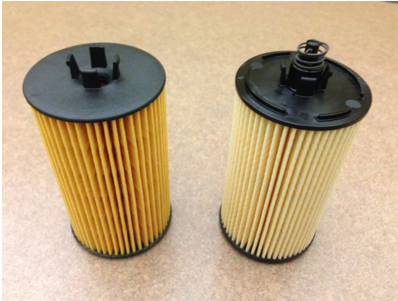
Hengst housing cartridge on left, UFI on right.

Engine and equipment manufacturer's warranties remain in effect when using Service Champ filters