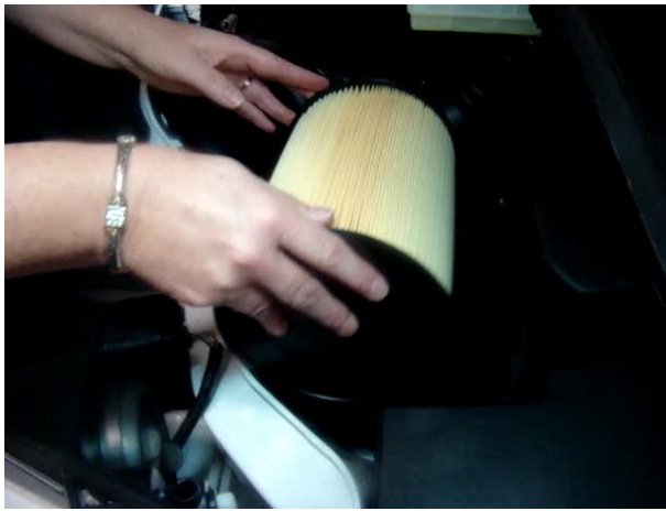
Figure 4: Install open end of filter over housing center tube