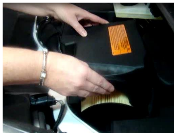
Figure 8: Complete Installation process

Questions – Please call FRAM Filtration Technical Line 1-800-890-2075 Option 2