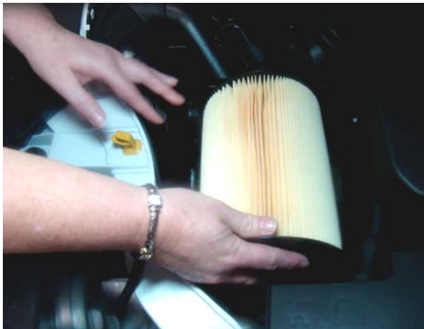
Figure 5: Bottom out open end of filter (top only)