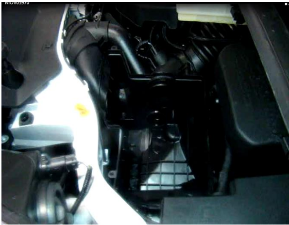
Figure 3: Housing cover and filter removed

With the housing cover removed and dirty filter removed (Figure 3), install new filter by tilting the open end of filter downward to slip over housing centertube (Figure 4). Next apply an inward force to bottom out filter open end on the housing (top only) (Figure 5). With filter fully engaged at the top, seat the bottom of filter in housing groove and inside of tabs by applying force with two hands below the center line of the closed end and push downward to seat the filter in housing (Figure 6 & 7). Filter is installed and typical installation can be completed.